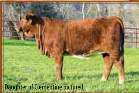
Daughter of Clementine pictured.

Lady Legacy is the caliber of female rarely found in donor herds due to the completeness she offers. Her straight lines and correctness were complimented by her overall depth, volume, and smoothness. Because of her phenotypic attributes, she easily classified U 1,2 and then received Typesetter status by age seven based on natural progeny alone. Lady Legacy has become a legend at Collier Farms producing both herd sires such as Logan's Legacy and El Nino as well as countless females that have gone on to be donor females in their own right. Dam of Lots 1A&B and 46.